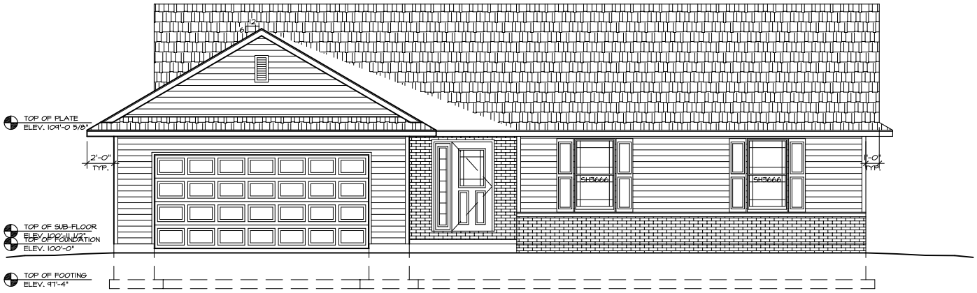
1 FRONT ELEVATION A-1